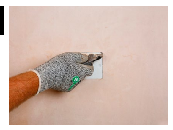
Remove the central area with a sharp hooked blade knife (or hole saw), being careful to avoid any wires within.