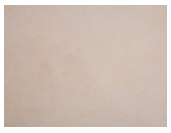
Plaster over the product and skim to a thickness of 2.5mm.