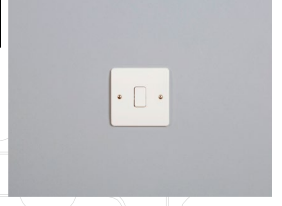
Install socket or switch as per manufacturer's instructions. Your snag-free installation is now complete.